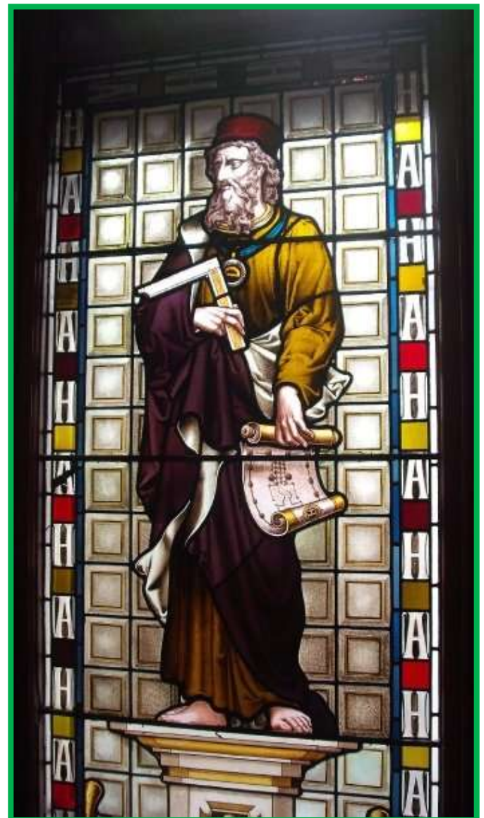
Window in the West depicting Hiram Abiff at Dunblane IX