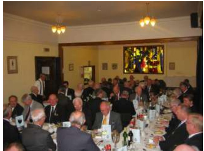
Lodge Scoon and Perth Past Masters dinner was held in the refectory at 5 Atholl Crescent Perth on Friday 6th February 2010.